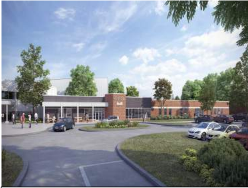
David E. Anderson SENIOR CENTER opens Fall 2019