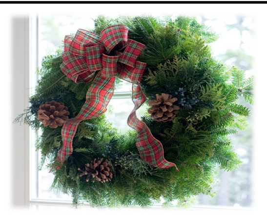
Holiday Wreath Workshop

Tuesday, October 17th 6:30—8:00 pm David E Anderson Senior Center | Art Room Class Fee $28 / Resident Discount $25