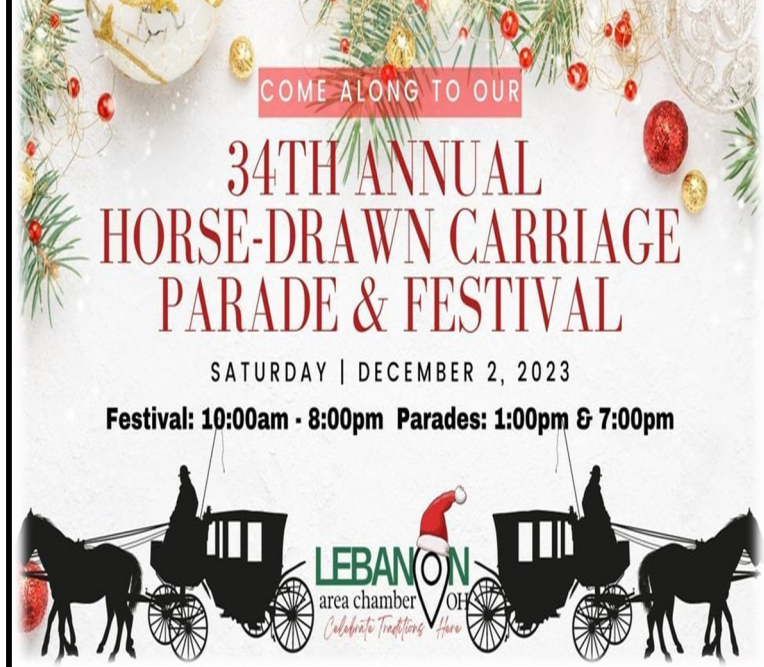
Saturday, December 2nd—Parade & Festival in Lebanon, Ohio

Love Horses? Then enjoy the 34th Annual Horse-Drawn Carriage Parade & Festival in Lebanon Ohio. You will not belive how manay carriges you will see. Lunch will be on your own with the festival vendors and Dinner will be on your own at the Famous Schmidts Sausage House in German Village in Columbus. Bus Leaves and Returns to the David E. Anderson Senior Center 36939 Ridge Rd. Willoughby, OH. 44094 Bus Departs: 7:30 A.M. Bus Returns: 7:30 P.M